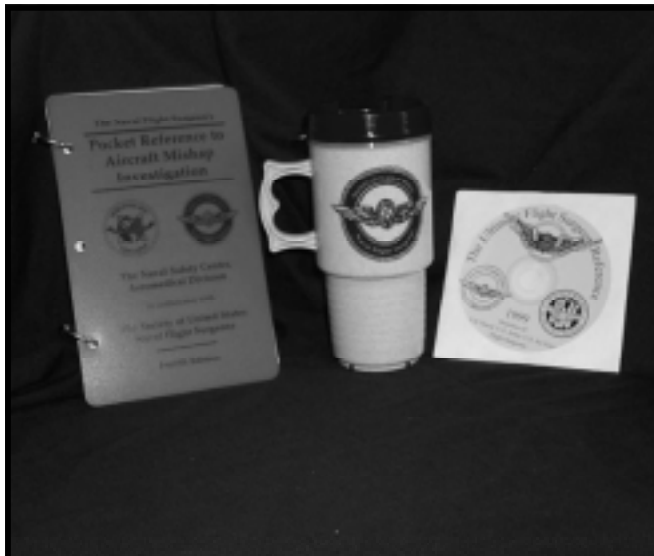
Pocket Reference, Travel Mug, CD: Ultimate FS