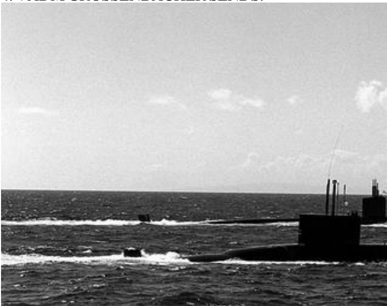
(P-3 over USS COLUMBUS (SSN 762) and Korean SS-66