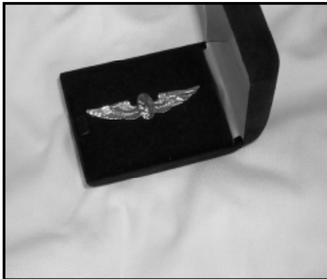
Full Size 14K Gold Flight Surgeon Wings