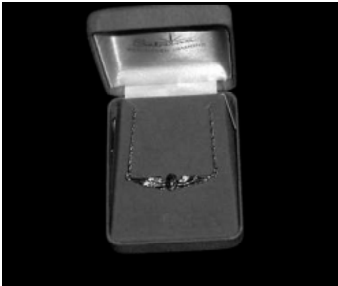
Sweetheart FS Wings Necklace, 14K Gold/Diamond Chip