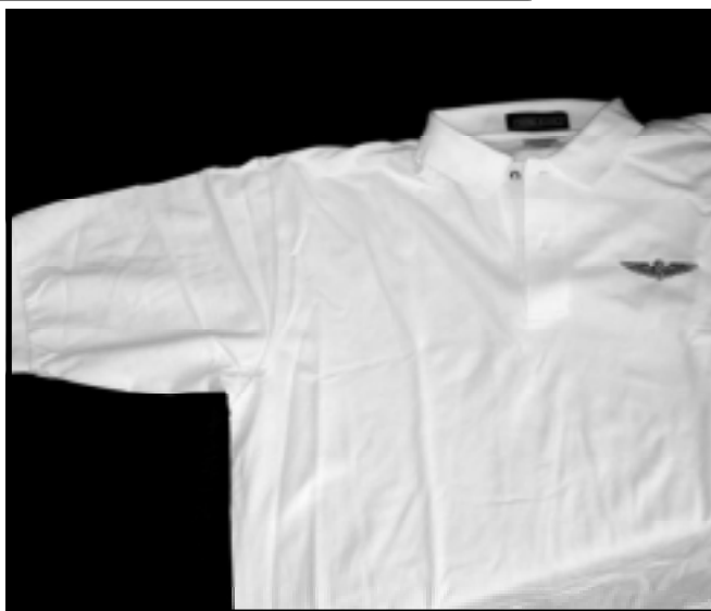
Polo Shirt: FS Wings