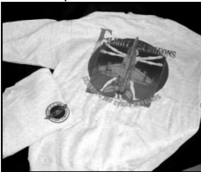
Sweat Shirt: SUSNFS "Leonardo"