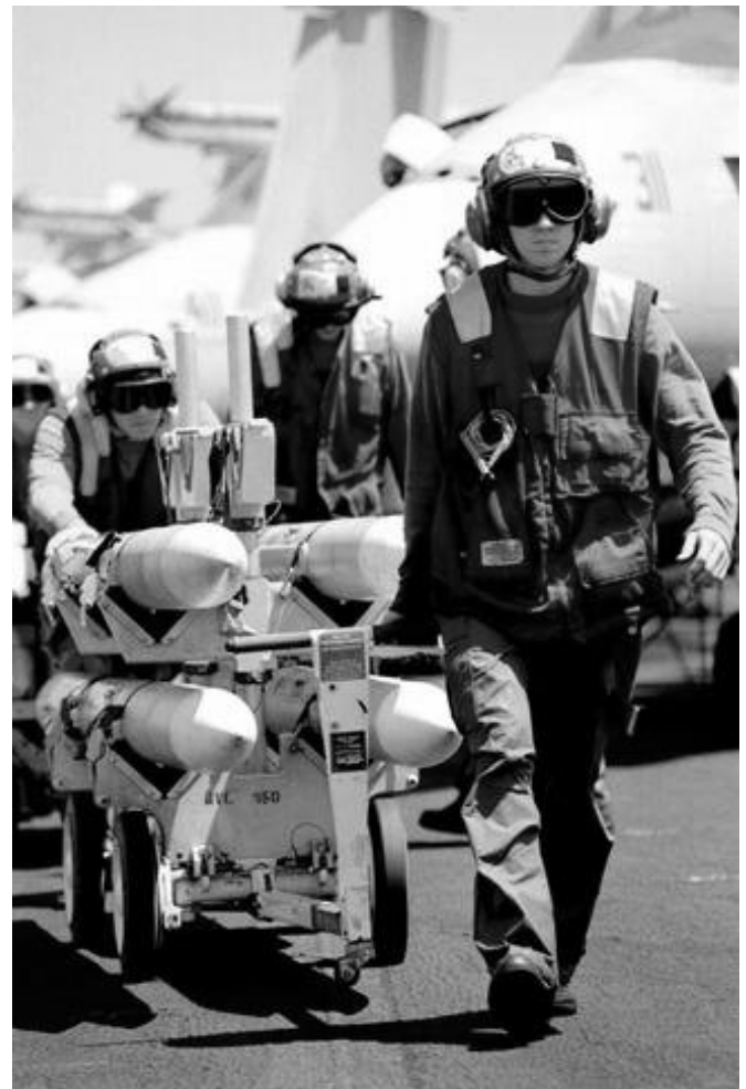
(Ordnancemen on CVN 71 USS Roosevelt)