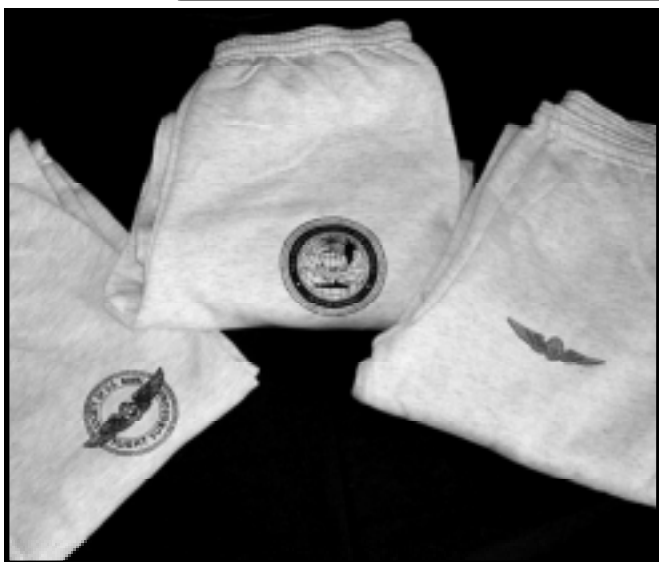
Sweat Pants: SUSNFS Logo, NAOMI Logo, FS Wings