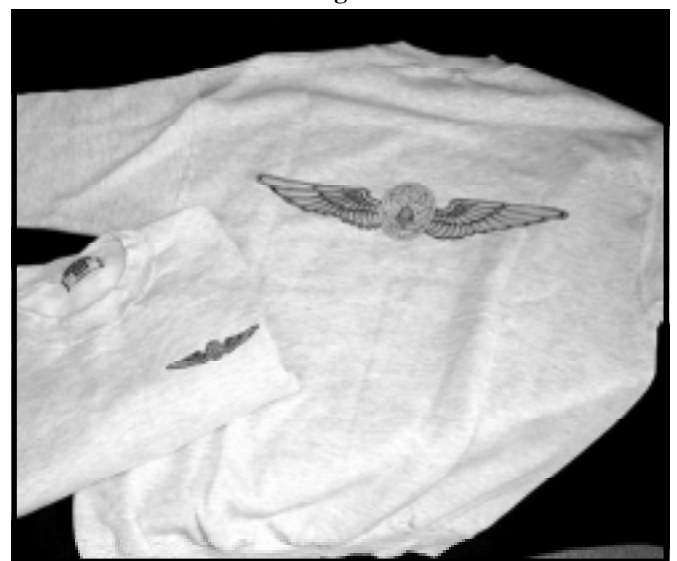
Sweat Shirt: FS Wings