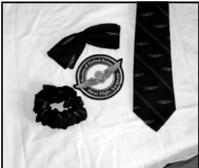
FS Wings 'Skrunchie', Bow Tie, Tie; SUSNFS Patch