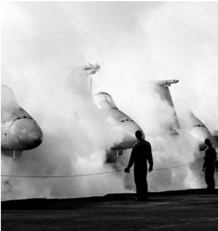
(USS George Washington Catapults