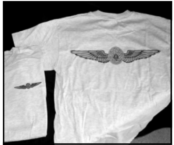
T-Shirt: FS Wings