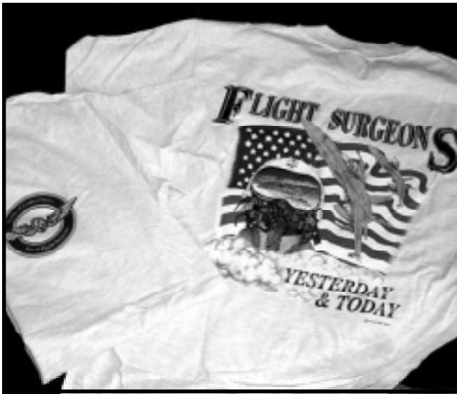
T-Shirt: SUSNFS "FS - Yesterday and Today"