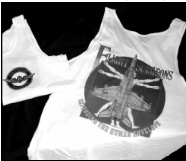
Tank Top Shirt: SUSNFS "Leonardo"